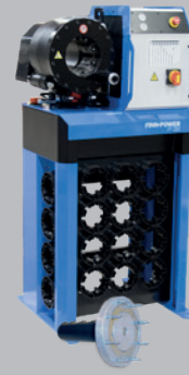
Tool base with QuickChange-tool as an option.