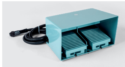
Foot pedal as an option.